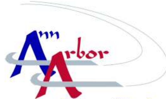
Figure Skating Club